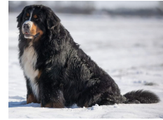
CH-HR CIB FICH JCH JCH JCH JCH LUX CH NL CH GEORGEOUS MC. GREY NHSB 2875813 | 2011 - 2022 | BG#87794 HD A ED-VRIJ