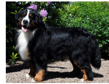
FICH MAGLOD-FALVI X-MAN MET 9293/08 | 2008 - 2012 | BG#77716 HD A/B ED 0/0