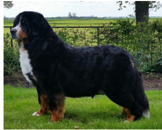
EMMY VOM RUMMELSBACH SSV/BS 54080 | 2011 - 2020 | BG#88132