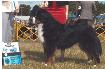
CH ARUNDEL'S STROKE OF LUCK V NASHEM WS41733504 | 2012 - 2019 | BG#94379 OFA/H-G OFA/EL EYES CARD vWD DM