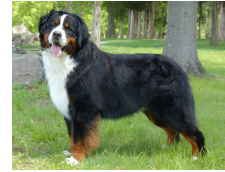
GCH ARUNDEL'S DIEZEL'S NOBODY'S FOOL WS30806001 | 2009 - 2018 | BG#75611 OFA/H-E OFA/EL EYES CARD vWD DM