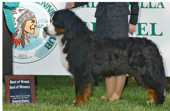
SIRE: CH ARUNDEL YES YOU STOLE MY HEART AT HAPI MTN WS45067703 | 2013 - 2019 | BG#109337 OFA/H-F OFA/EL EYES CARD vWD DM