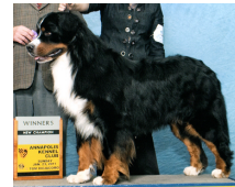
Am/Can CH MONCHSBERGS KITZBUHEL WS28053002 | 2008 - 2018 | BG#62251 OFA/H-G OFA/EL EYES CARD vWD DM