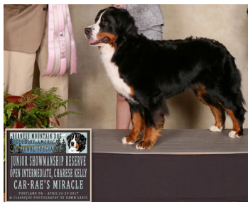
DAM: CAR-RAE'S MIRACLE WS48499708 | 2014 - | BG#115962 OFA/H-G OFA/EL CARD vWD DM