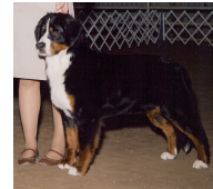
CH JENDA'S N NASHEM PARTY LIKE A ROCK STAR WS27916402 | 2008 - 2019 | BG#65101 OFA/H-G OFA/EL EYES CARD vWD