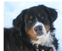
ARUNDEL HANNAH LALITHA MAISIE WS26622501 | 2008 - 2016 | BG#77637 OFA/H-F OFA/EL CERF CARD vWD