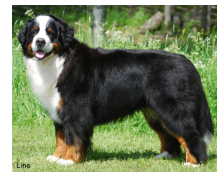
DK CH FICH IT CH NO UCH NORD CH SUCH ODYSSEUS S54697/2006 | 2006 - 2015 | BG#68645 HD GRAD A ED UA (0) DM