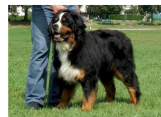
OEST CH XANDER'S HILL HAPPY OHZB/BS 4140 | 2005 - | BG#66762 HD A ED-NORMAL