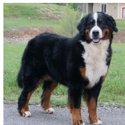
CH BERNTIERS SUNSHINE BOSS WS36171701 | 2010 - 2020 | BG#78537 OFA/H-G OFA/EL CERF CARD vWD DM