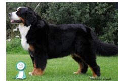
SE Uch BERNTIERS JUST FOR ME S17015/2008 | 2008 - | BG#57970 HD GRAD A ED UA (0)