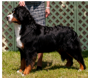
CH ARUNDEL'S STARLIGHT SERENADE WS37321901 | 2011 - 2019 | BG#85197 OFA/H-G OFA/EL EYES CARD vWD DM