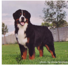
CH TI GUS SEN DE LA BUTTE LS774243 | 2001 - 2009 | BG#36978 OFA/H-G OFA/EL CERF CARD vWD