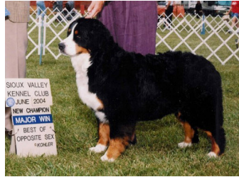
CH BLUMOON'S BREAD N BUDDER WP99028501 | 2000 - 2006 | BG#36301 vWD

EQ295735 | 1995 - | BG#18228 OFA/H-E OFA/EL