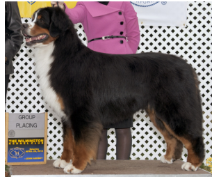
GCH JENNYCREEK'S LORD BACCHUS WS18917504 | 2006 - 2014 | BG#44383 OFA/H-E OFA/EL CERF vWD DM