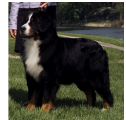
CH Can GCH DARLA V GRÄNZWEG SHSB 572432 | 1998 - 2009 | BG#64063 OFA/H-G OFA/EL CERF CARD vWD