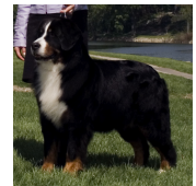
CH Can GCH DARLA V GRÄNZWEG SHSB 572432 | 1998 - 2009 | BG#64063 OFA/H-G OFA/EL CERF CARD vWD