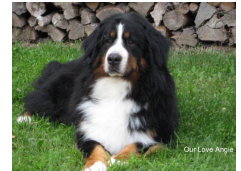
ROSA'S ANGELINA LAGRAND DAMME WR04046602 | 2001 - 2012 | BG#20337 OFA/H-E OFA/EL CERF vWD