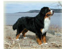
Am/Can CH AHQUABI'S BANK ON IT WP95996503 | 2000 - 2010 | BG#52396 OFA/H-G OFA/EL CERF CARD