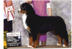
CH RAVEN V'T RIJKENSPARK WS11622301 | 2004 - | BG#41041 OFA/H-F OFA/EL CERF CARD vWD