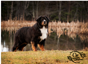
DAM: Can CH BACKCOUNTRY KATJE UE212481 | 2008 - 2019 | BG#59236 PennHIP OVC/EL EYES CARD vWD