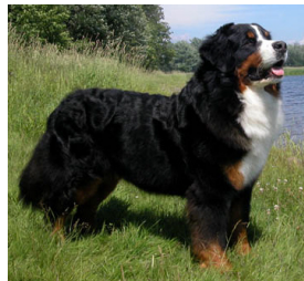
Can CH BACKCOUNTRY GRIETJE NE856709 | 2003 - 2012 | BG#64432 OVC/H-N OVC/EL CERF CARD