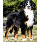
CH ADESA'S AND THE BEAT GOES ON WS11344803 | 2004 - 2013 | BG#42466 OFA/H-G OFA/EL CERF CARD