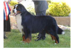
CH Can GCH SWISSKISS HE'S A SWEET TALKER MW843411 (CKC) | 2002 - 2010 | BG#19610 OVC/H-N OVC/EL CERF CARD vWD