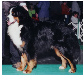
CH TOP HAT'S STAR MAKER WP62064602 (AKC) | 1995 - | BG#14769 OFA/H-E OFA/EL CERF