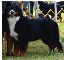
GCH ALPENSPIRIT IT'S OUR GAME WS39226802 (AKC) | 2011 - | BG#85199 OFA/H-G OFA/EL CERF